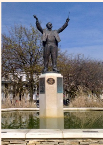
Statue to the composer Gustav Holst in Cheltenham. 29th January